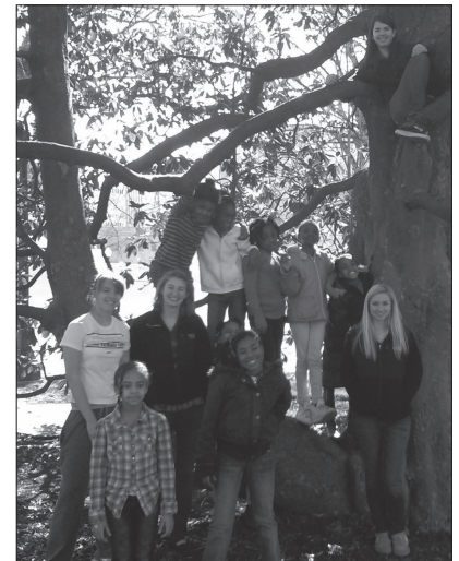
Saturday Sisters gather outside

On a recent Saturday, the group shared ways they had shown kindness to others and ways others had been kind to them during the week. The relationships within the group grow visibly throughout the year and across the years, as the Saturday Sisters program continues to flourish at St. Paul's.