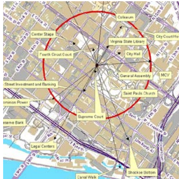
Map by the City of Richmond for St. Paul's, a registered landmark.