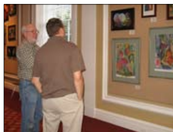
Pictured: Visitors take in the art on First Friday, May 7. Fox Elementary School's Children's Choir performed at 7 p.m.

With the ongoing support of vestry and clergy, St. Paul's will continue our participation in the art walk for the 2010-2011 season.