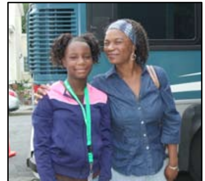
Family Support: A mother drops her daughter off at the bus for 4H Camp.