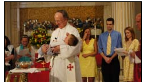
Pictured: Baptisms at St. Paul’s on Pentecost, 2011.

Baptism is the sacrament of our Christian faith. It is the event that begins our Baptismal adventure connecting our Sunday Faith with our Monday lives. There are four principal Sundays for Baptisms that highlight our understanding of its importance: All Saints’ Sunday in early November, our admission into the community of saints – the Church ( 1 Corinthians 12:12ff ); The Baptism of Jesus in early January; as Jesus, so we are Baptized ( Luke 3:21-2 ); Easter in spring, sharing in Christ’s death and resurrection ( Romans 6:3-5 ); and Pentecost in May, being reborn by the Spirit ( John 3: 1-6 ).