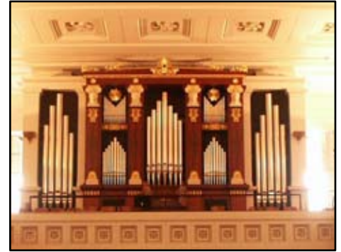
St. Paul's Rosales Organ

Designed by noted Los Angeles organ builder Manuel Rosales, and finally installed and given voice by the hard work and persistence of many St. Paul's parishioners, it is a remarkable achievement. All organs are designed to hold together many disparate elements (2,667 different pipes in our case), but few work as seamlessly and as convincingly as the organ at St. Paul's.