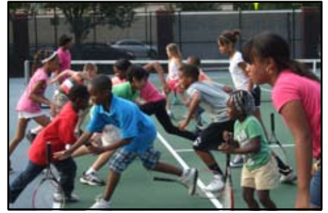
Activity: Warming up on the tennis court at Camp Alkulana