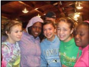
Love One Another: Micah campers and new friends bid a tearful good-bye at Camp Hanover