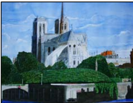
Painting by Bob Wynne, on display September 2011

This September will feature a new exhibit of paintings and photographs inspired by the American West and Western Europe by Bob Wynne.