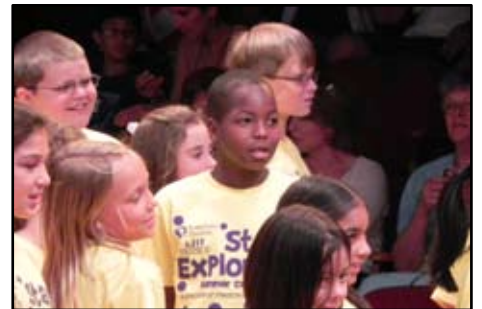
New Experiences A young man stands tall on stage at Theatre IV camp (above) and a young girl stretches at Latin Ballet camp (below).